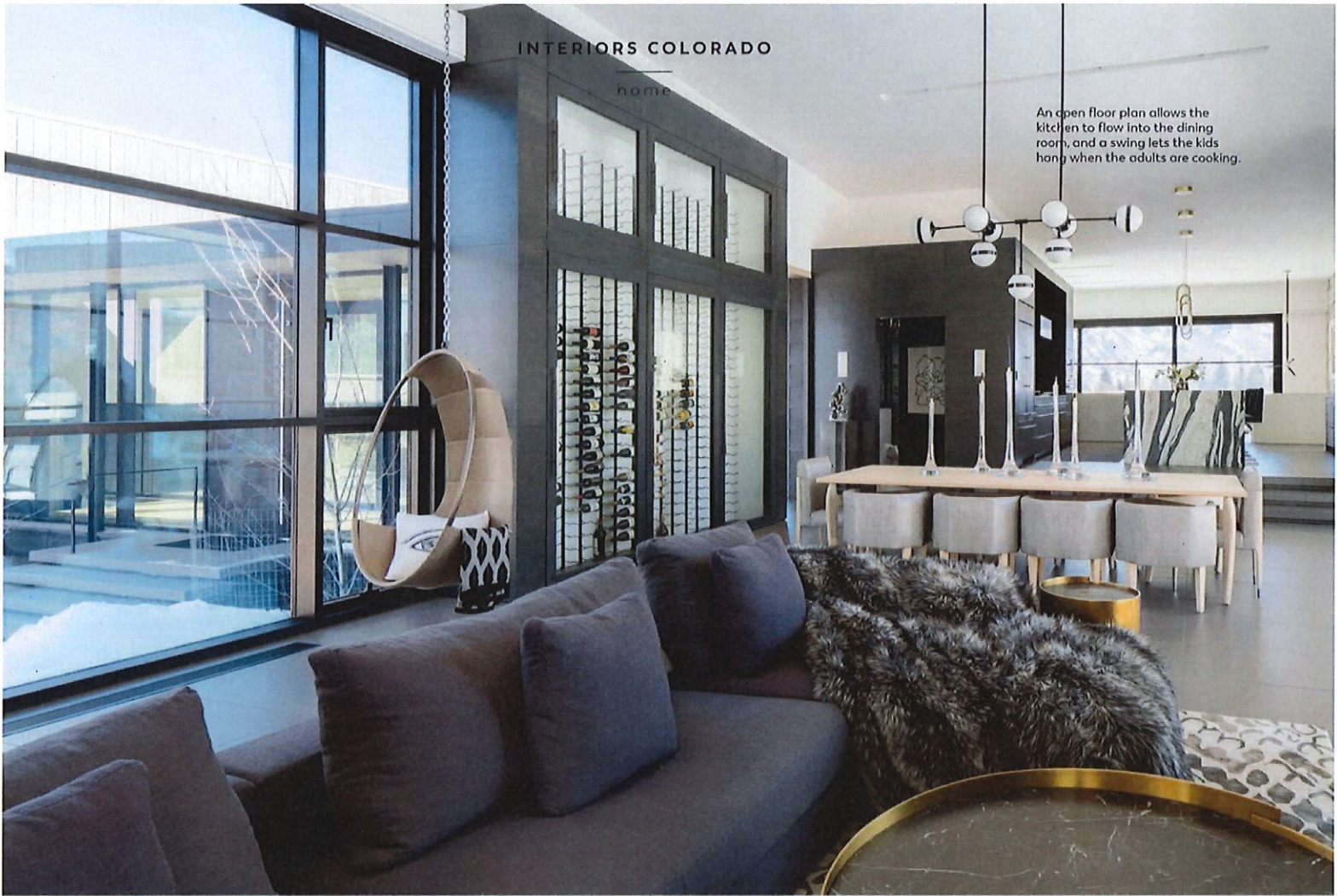
An open floor plan allows the kitchen to flow into the dining room, and a swing lets the kids hang when the adults are cooking.