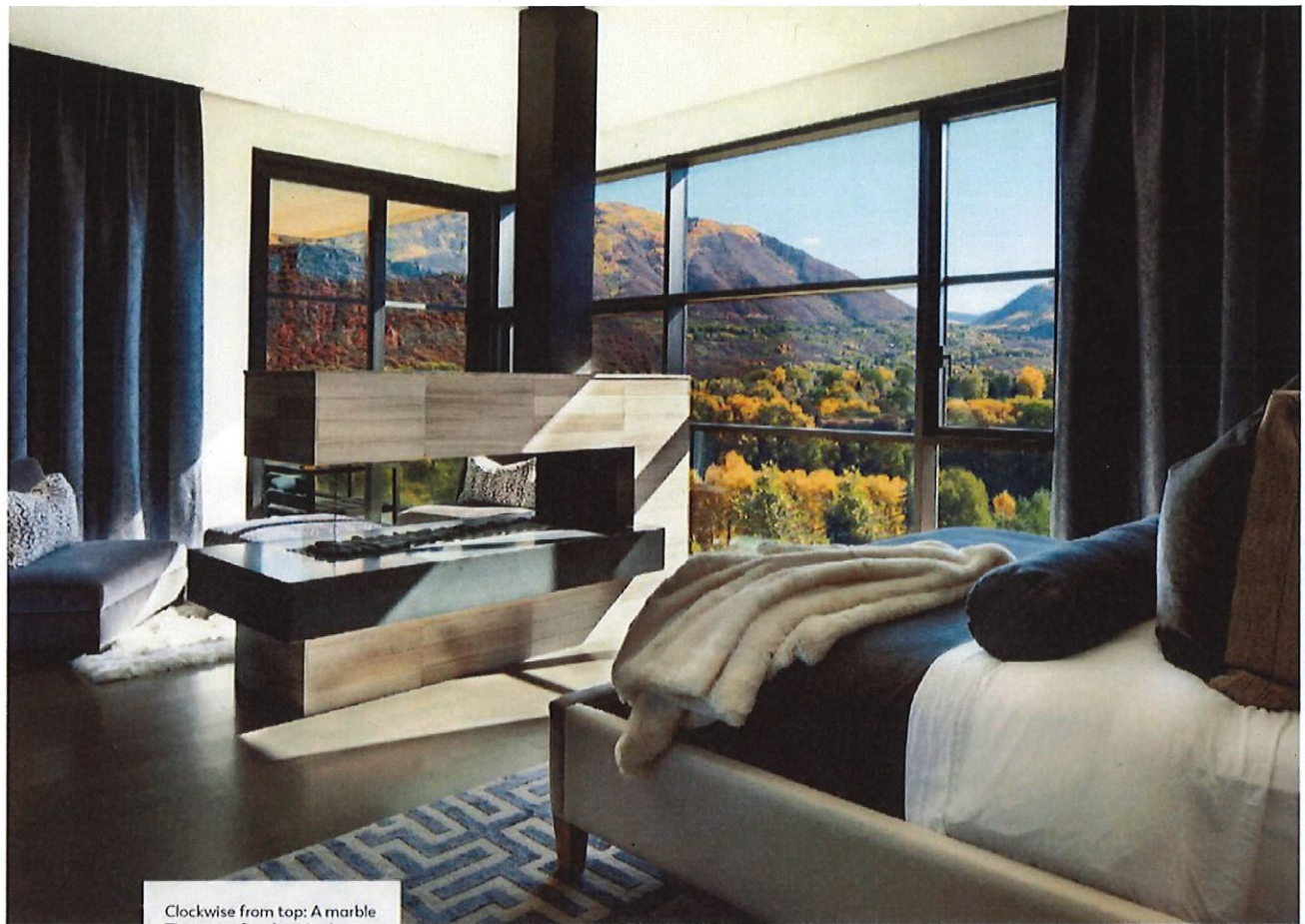
Clockwise from top: A marble Thorntree fireplace in the master bedroom; floor-to-ceiling windows make walkways seem like outdoor interludes; neutral colors dominate the interior palette.