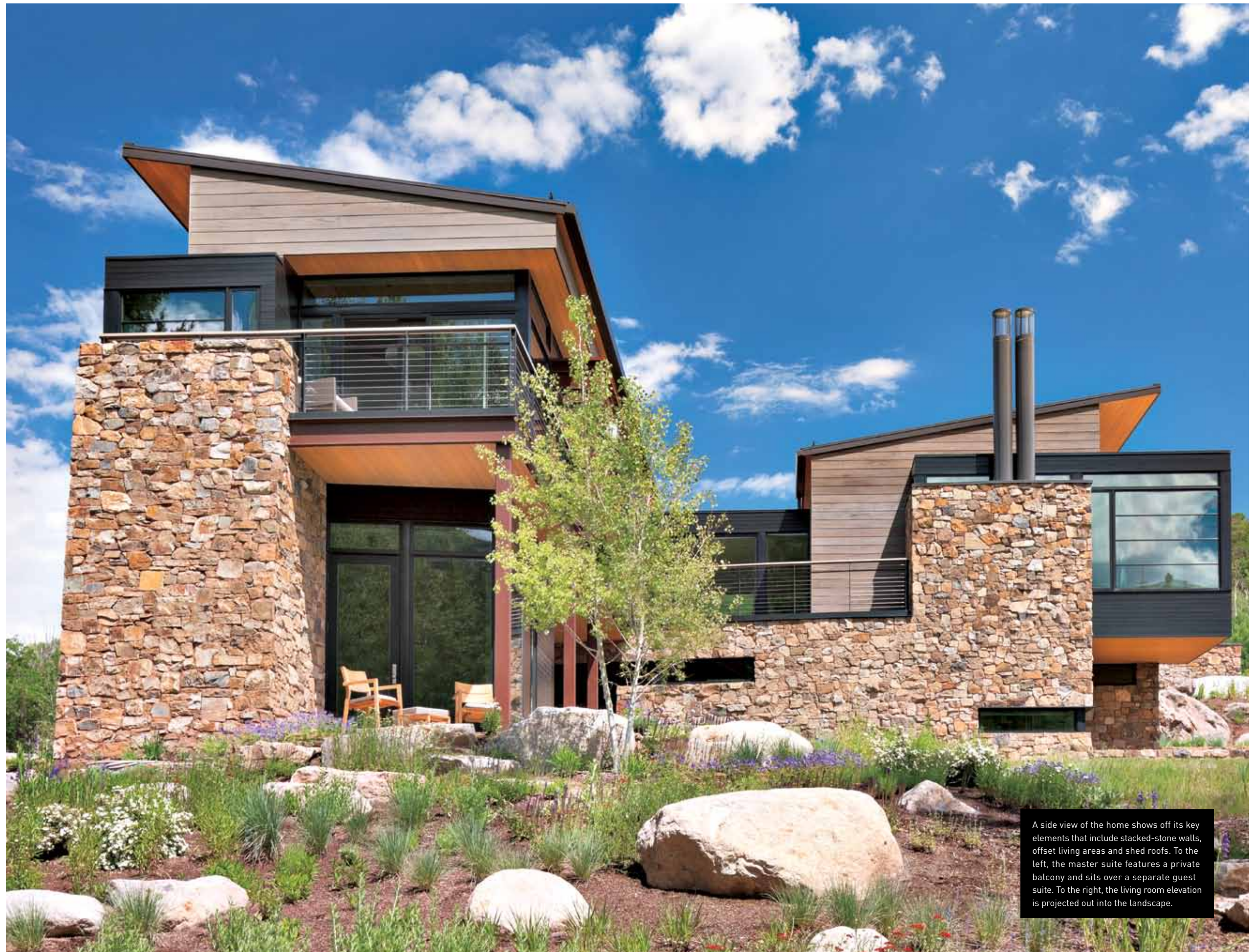
A side view of the home shows off its key elements that include stacked-stone walls, offset living areas and shed roofs. To the left, the master suite features a private balcony and sits over a separate guest suite. To the right, the living room elevation is projected out into the landscape.

The home's architecture was indeed a major influence on the interiors. "The house was beautifully proportioned and designed," says Bohn. "The materials were natural, luxurious and practical, and so we took the color scheme from them." Throughout, furnishings were selected for